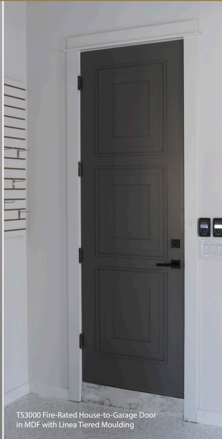
TS3000 Fire-Rated House-to-Garage Door in MDF with Linea Tiered Moulding