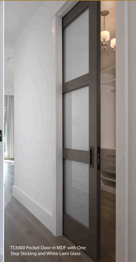
TS3000 Pocket Door in MDF with One Step Sticking and White Lami Glass