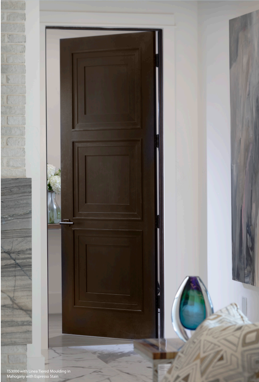
TS3000 with Linea Tiered Moulding in Mahogany with Espresso Stain

"The home was gutted to the studs, reconfigured throughout and given an all-new look with contemporary, island-style architecture." TruStile was proud to sponsor a unique interior door package, including Tiered Mouldings to complement stepped millwork details featured throughout the home, to help the team achieve their goals. The remodel exemplifies how an existing home "can be significantly improved in design, livability and energy efficiency when using today's building techniques, products and standards."