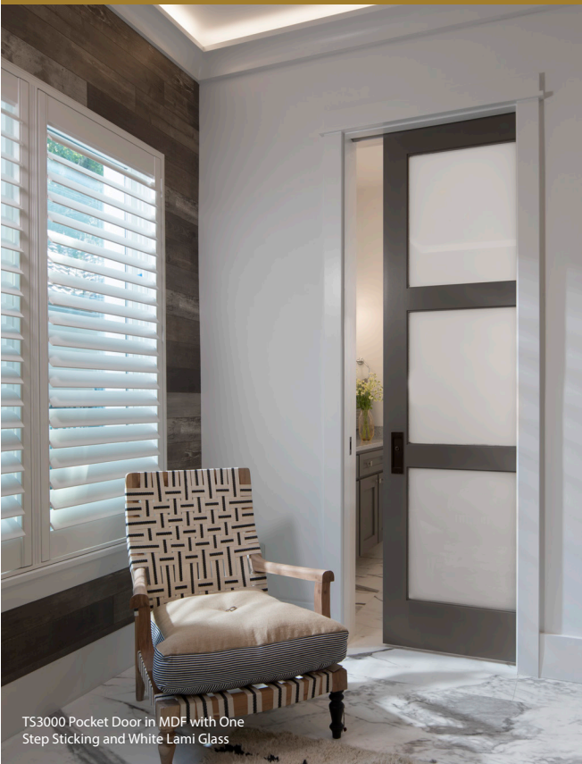
TS3000 Pocket Door in MDF with One Step Sticking and White Lami Glass

Kean's team and TruStile chose a mix of paint-grade and stain-grade TS3000 doors to fit each opening in the 4,500-square foot home. TruStile's versatile product line made it easy to use the same door style in different applications. Pocket doors, a house-to-garage door, and even a matching elevator door blend together seamlessly so that the remodel doesn't have to sacrifice style for functionality. Kean's team used a mix of glass and tiered mouldings to differentiate TS3000 profiles throughout the home. The Linea Tiered Moulding offers a crisp stepped profile that redefines a traditional panel door. White Lami glass with a One Step profile creates a clean, modern aesthetic giving the home an updated yet classic look.