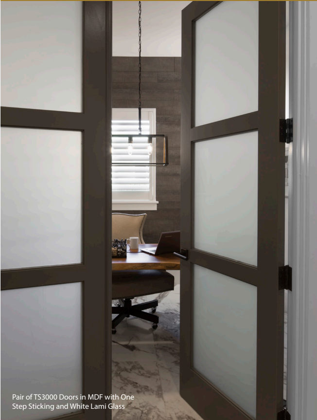
Pair of TS3000 Doors in MDF with One Step Sticking and White Lami Glass